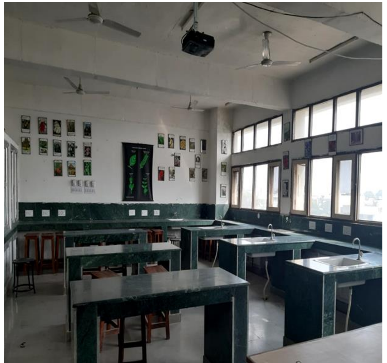
BOTANY LAB -II