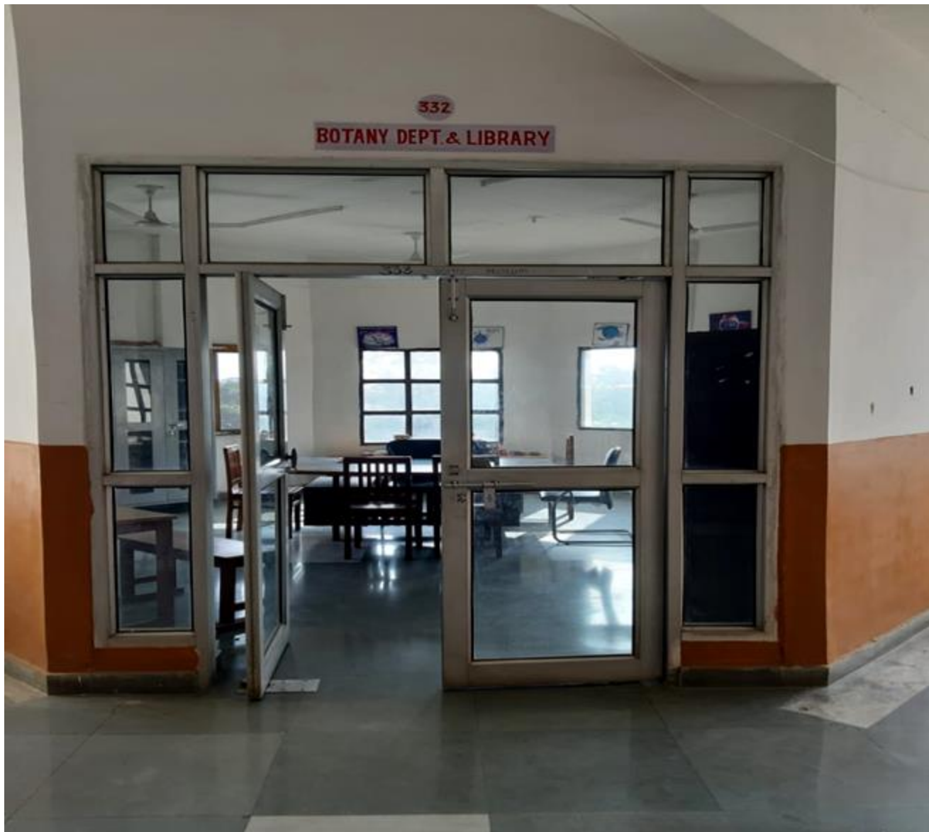
BOTANY DEPARTMENT AND LIBRARY