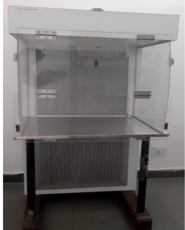
Laminar Air Flow Chamber