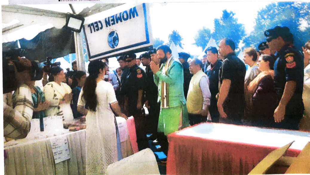
Government Post Graduate College for Women Sector 14, Panchkula, Haryana, India (IIC ID - IC202427601)